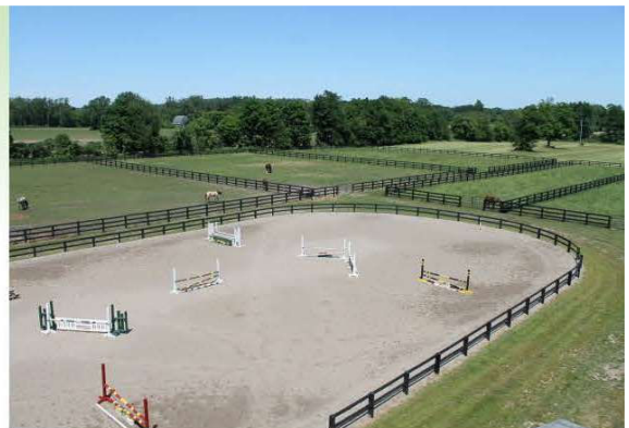
Showing on the MHJA & HJAM Circuits

Visit us on Facebook "West Wind Equestrian, LLC"